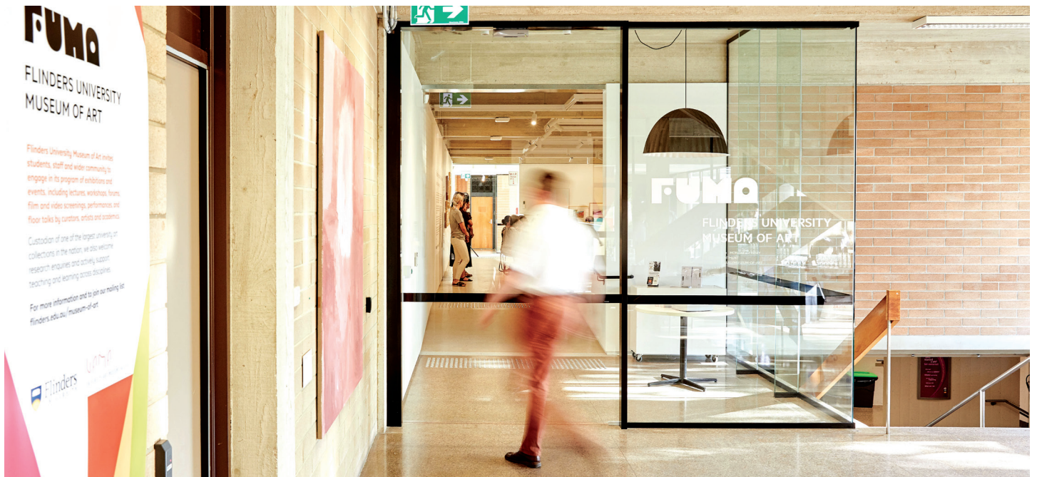
Image: Exhibition launch of Tjina Nurna-Ka, Pmarra Nurna-Kanha, Ibla Ibla Nurna-Kanha: Our Family, Our Country, Our Legacy, 2019, Flinders University Museum of Art.