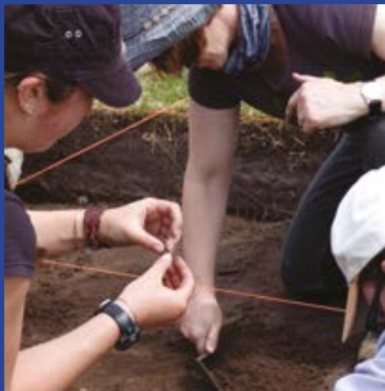
Pictured left: Students excavating Mary McKillop's first stable school in Penola South Australia.

We offer more field schools in more locations than any other archaeology department in Australia. Previous field schools have taken students to Arnhem Land, Vietnam, Tasmania, the Eyre Peninsula, Port Philip and western Queensland.