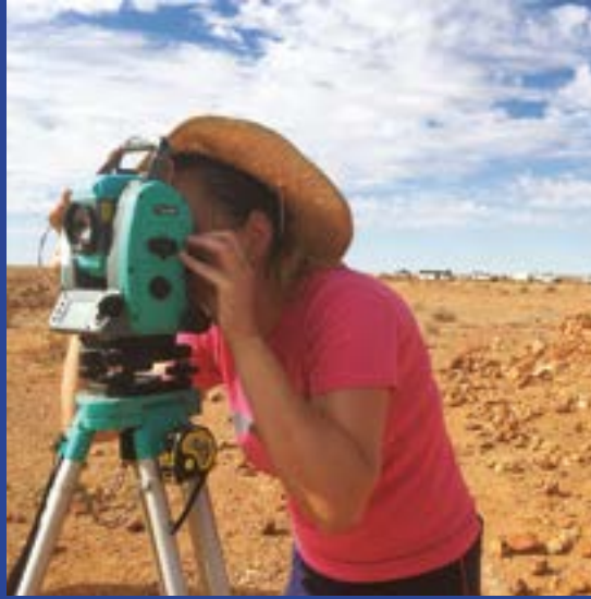
Pictured left and bottom: Students participating in Historical Archaeology Field School held at Boulia in Queensland, excavating the Burke River Native Mounted Police camp.

We offer more field schools in more locations than any other archaeology department in Australia. Previous field schools have taken students to Arnhem Land, Vietnam, Tasmania, the Eyre Peninsula, Port Philip and western Queensland.