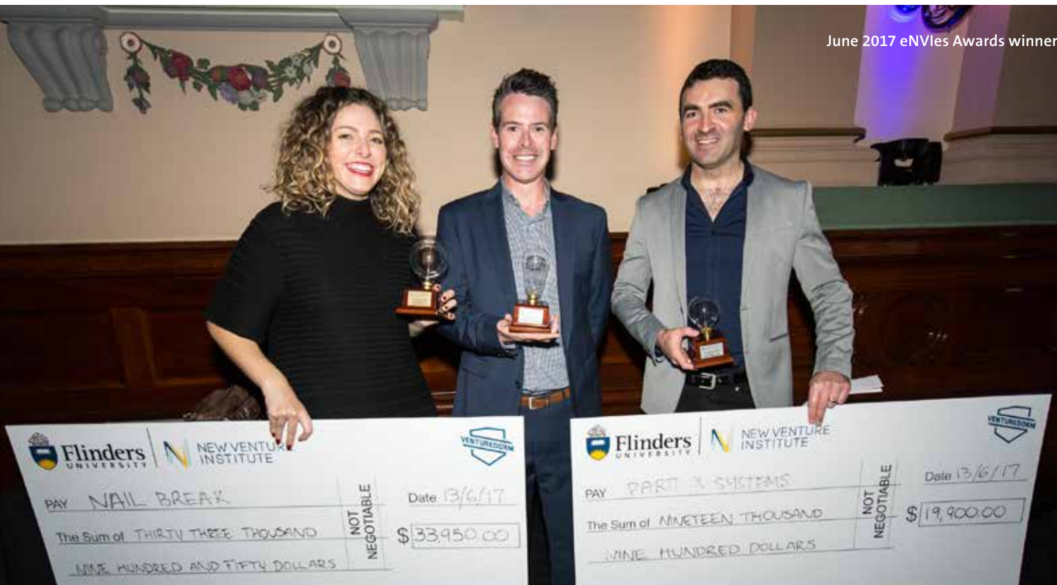
June 2017 eNVies Awards winners