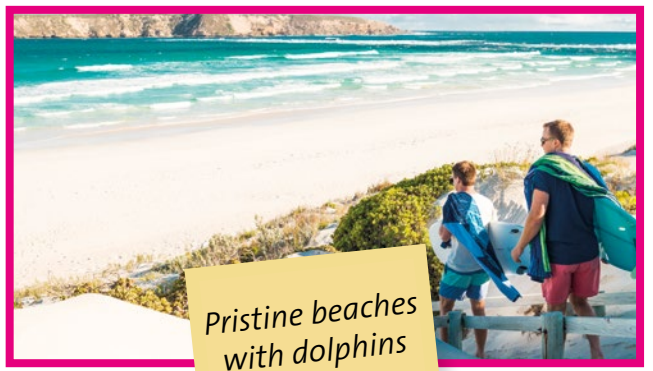
Pristine beaches with dolphins and sea lions