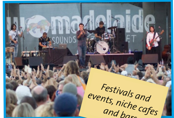
Festivals and events, niche cafes and bars