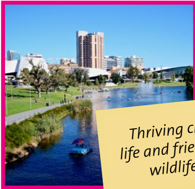
Thriving city life and friendly wildlife